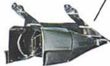
袖叉模具 Placket Folder (選購配備Optional)

馬達延時控制器Motor Timer (關機後30分鐘自動延時皮帶冷卻裝置. Make sure to turn timer at least 30min after shut off to cool down the belt.)